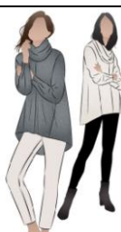
Freya knit tunic Style Arc