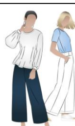
Fifi woven pant Style Arc