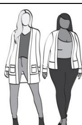
Blackwood knit Helen's Closet